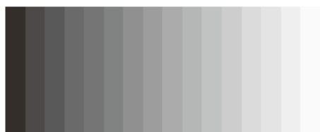
Low gray scale